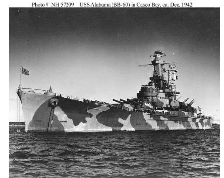
The camouflaged USS Alabama saw honorable combat service in the Pacific Theater during World War II.

when it found a permanent-home berthing in Mobile at the newly opened Battleship Memorial Park. A former WWII submarine USS Drum also is located at this park.