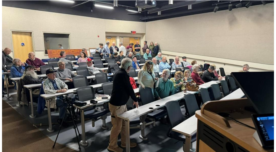
Over fifty attendees