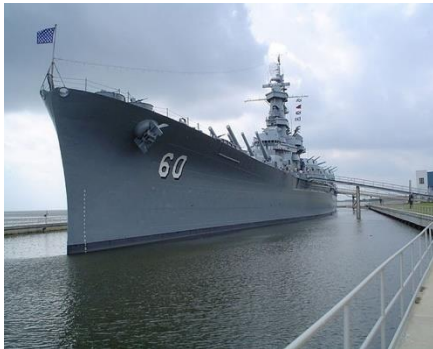
Built by Norfolk Navy Yard during World War II, USS Alabama is permanently berthed at the USS Alabama Memorial Park in Mobile.

Norfolk Naval Shipyard's USS Alabama float is scheduled to participate in the City of Portsmouth's 2024 Memorial Day Parade—its 140th.