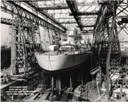
USS Alabama being constructed on Norfolk Naval Shipyard's Building Ways during World War II.

class project at Norfolk Naval Shipyard, it's a float that depicts the battleship USS Alabama (BB 60). While I was researching and writing this story, I came across a 2004 book "The World War II Memorial," by Douglas Brinkley. In his book Brinkley noted that legendary baseball great Bob Feller of the Cleveland Indians served aboard USS Alabama as a Chief Petty Officer and anti-aircraft gun captain in a 40-millimeter squad. He reportedly was the first major league player to enlist in the military after the Japanese bombed Pearl Harbor, Hawaii. Feller