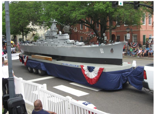
Norfolk Naval Shipyards' USS Alabama float always is a crowd pleaser at the City of Portsmouth's Memorial Day parades.

A highly detailed and attractive replica of an American battleship has been delighting spectators for many years at the City of Portsmouth's Memorial Day Parades and other community events. Built as an Apprentice