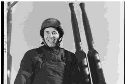
Famous baseball pitcher Bob Feller of the Cleveland Indians volunteered for Navy service during World War II. Here, he was a gun captain aboard USS Alabama.

class project at Norfolk Naval Shipyard, it's a float that depicts the battleship USS Alabama (BB 60). While I was researching and writing this story, I came across a 2004 book "The World War II Memorial," by Douglas Brinkley. In his book Brinkley noted that legendary baseball great Bob Feller of the Cleveland Indians served aboard USS Alabama as a Chief Petty Officer and anti-aircraft gun captain in a 40-millimeter squad. He reportedly was the first major league player to enlist in the military after the Japanese bombed Pearl Harbor, Hawaii. Feller