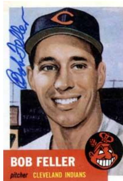
Bob Feller's professional baseball card.

But the noted young baseball player put his career on hold for four years and served honorably in combat. After the war he returned to pitch for the Cleveland Indians during his 18-year career and was inducted into the Baseball Hall of Fame.