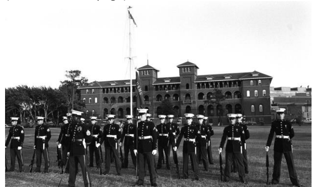
Marines on Parade field in front of Building M32